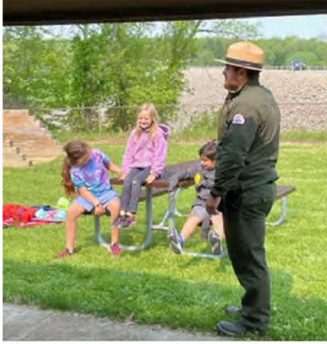
On site water safety boat scenarios. Had students perform boat accident scenarios where life jackets are key to survival.

Participating in the "I Got Caught" initiative. Handing out beach towels to adults that were wearing their life jackets on USACE property.