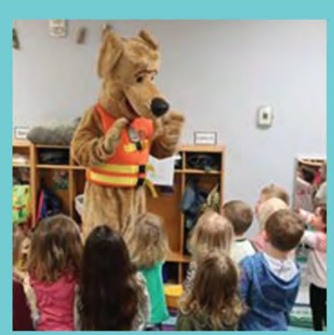
Bobber visits the Child Development Center on the Rock Island Arsenal to promote water safety to 75 younger kids.

Celebration Belle Educational Cruises. The Corps partners with a local excursion boat The Celebration Belle to provide a unique field trip to area schools. During the downriver cruise of the Mississippi River, students learn a little history of the area while enjoying the view from the top deck of the boat. On the way back upriver they are presented an interpretive program, which includes water safety, from a Corps Park Ranger. The Corps helped with 3 different cruises in which 454 students attended.