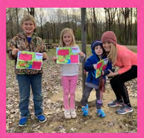
Utilized Bobber in campgrounds during Memorial Day to promote water safety.

Began giving out Water Safety Scavenger Hunt forms in the campgrounds and gave prize to kids that completed form.