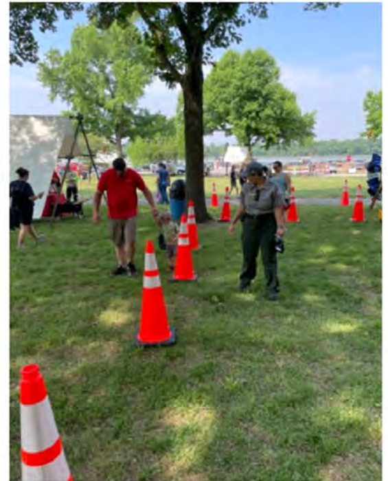
Park rangers, staff, and a volunteer provided general and water safety support at the annual Two Rivers Family Fishing Fair at Pere Marquette State Park. Approximately 5,000 guests (including 2,000 children) attended the event. We directly engaged an estimated 2,000 visitors throughout the day at our booth, which included water safety discussions and a drunk goggle obstacle course. Hundreds of water safety-themed gear were given out at the event.

Over the holiday weekend, the National Great Rivers Museum hosted a water safetythemed scavenger hunt. Ten water safety-themed items were hidden throughout the museum along with a letter. 232 visitors earned a water safety-themed goody bag by finding the hidden phrase.